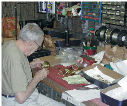
Restoring metal antiques is an art. Each item is carefully taken apart. A hand drawing of each piece of the item is made showing where the piece fits when re-assembled.

Al Bar Wilmette Platers itself has a history dating back to the 1800s. Two shops merged—one called Al Bar Platers