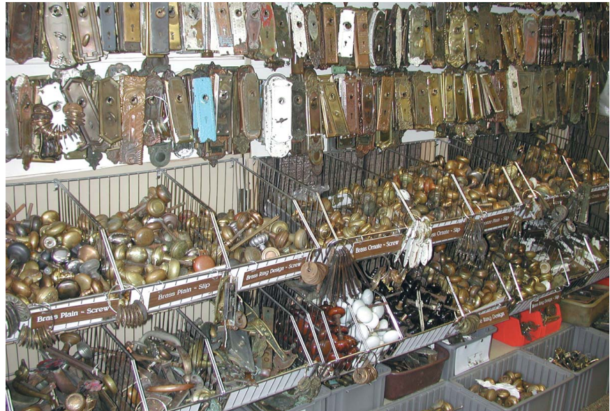
The shop keeps one of the largest inventories of antique door hardware in the world. These parts are used for restoring older homes.

and another called Wilmette Finishing Labs—so the owners combined the two names. The shop made several moves through the years, and made a transition from a main stream jobshop to a boutique plating shop.