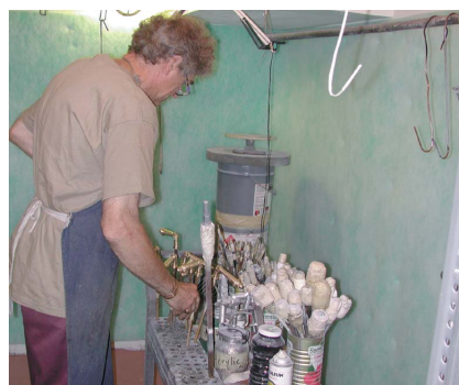
Like everything else in the production area of the plating shop, pretreatment is accomplished by hand. Each piece is treated separately, depending on the type of metal and the type of finish it will receive.

Items restored at the shop range from door hardware (a large percentage of the