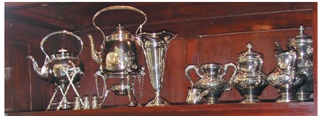
Silver plating antique items such as these is a specialty of the refinishing business at Al Bar Wilmette Platers.