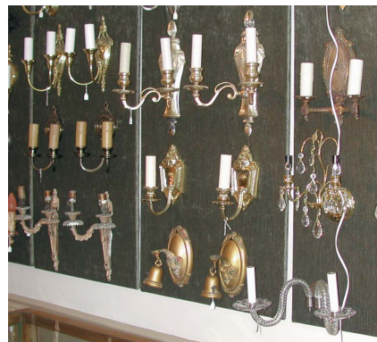
The company keeps an extensive inventory of antique lighting fixtures, such as these.